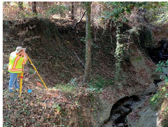
SEVERELY ERODED STREAMBANK

For questions, comments, or concerns specifically about any of these projects, please contact: