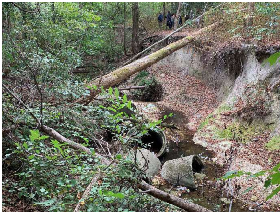
DAMAGED 60" PIPE OUTFALL

This $3.33 million project seeks to stabilize and restore 2,220 linear feet of degraded stream channel to improve safety. Supplemental goals include increased recreational and educational opportunities, decreased flooding risk, and improved habitat within the Pine Camp Cultural Arts and Community Center community.